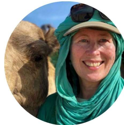
Alice Morrison Adventurer, TV presenter and author